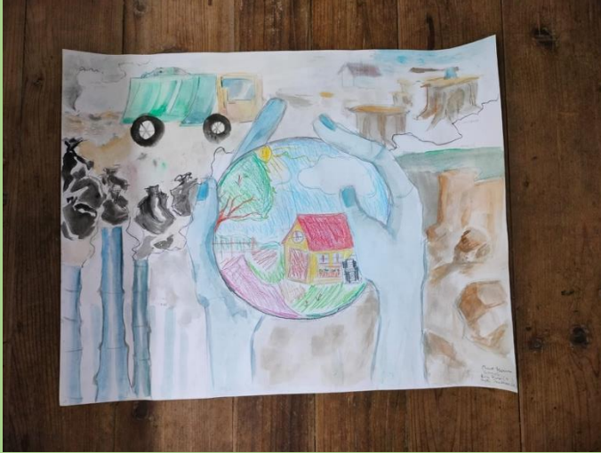
1 st Place