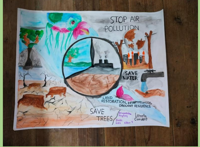
2 nd Place