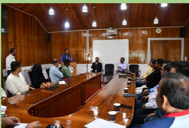
Fig: Education visit of Indian Forest Service Officers on 01.05.2024